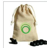
Stylish cotton pouch, cord clip and four sized silicon ear fittings.