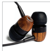
Side view with black silicon ear inserts. (Black Chocolate shown)